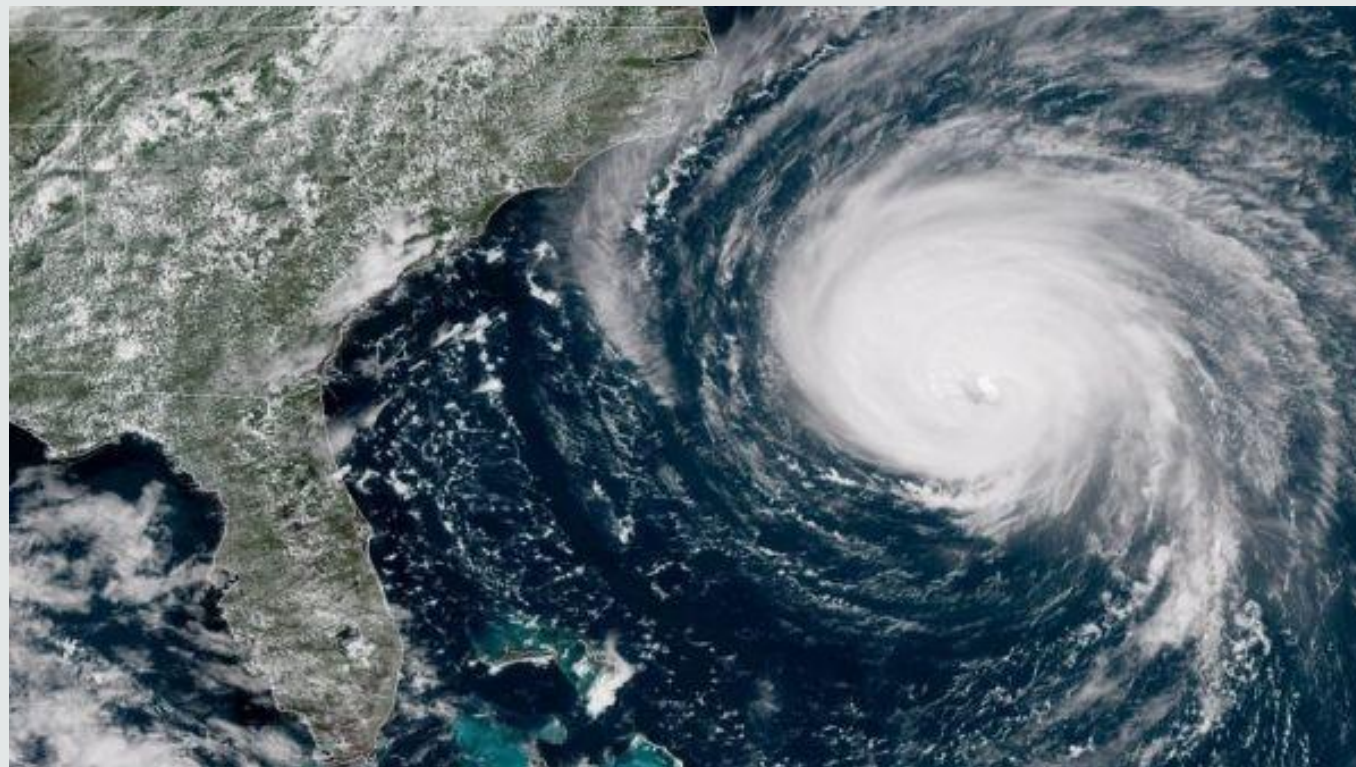
Eastern board hurricanes