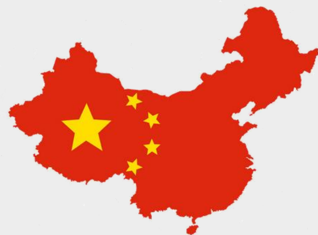
TOBACCO PRODUCTION IN CHINA