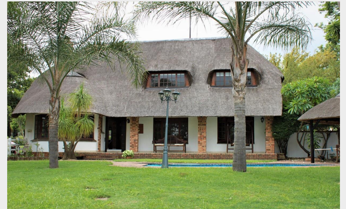
Johannesburg, South Africa