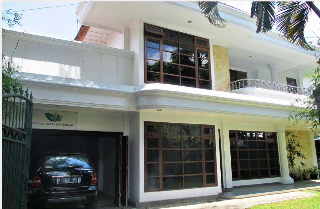
Far East Leaf Indonesia